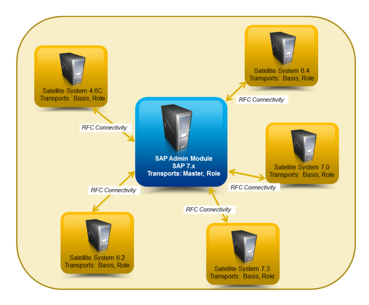
Figure 2: Transports for FlexNet Manager for SAP Applications in the SAP system landscape